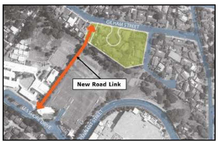
Figure 6: Proposed new road