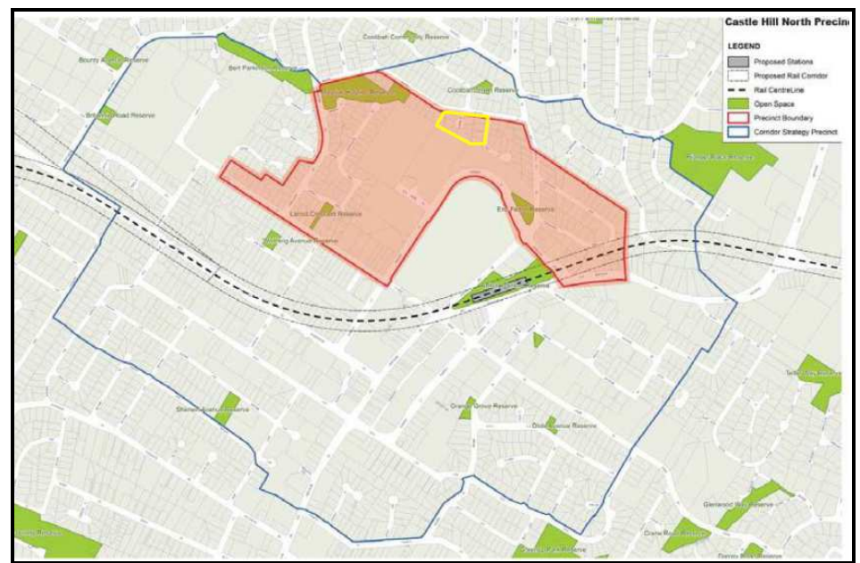
Figure 1: Vivien Place site within the broader Castle Hill North and North West Rail Corridor Boundary

The subject site (identified in yellow in Figure 1), is located within the Castle Hill North Precinct Planning Proposal PP_2016_THILL_002_00.