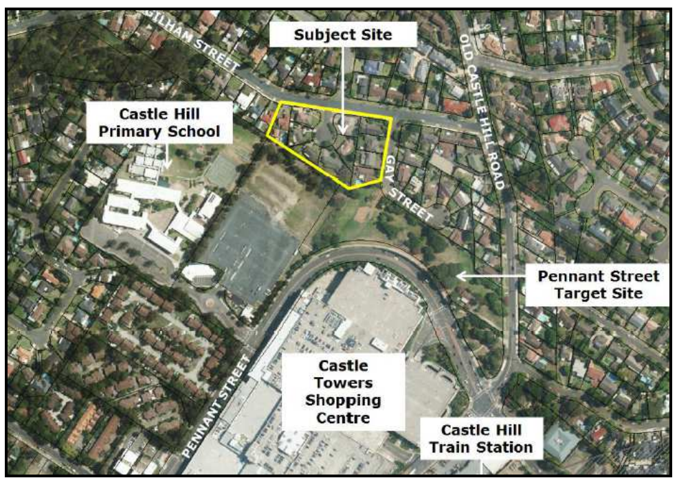
Figure 3: Subject site and surrounding area

Due to the introduction of a rail line and station at Castle Hill, the area is likely to undergo significant change and the proposed development is not considered out of keeping with the anticipated growth within this area, as set out in the Strategy.