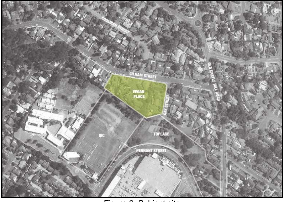
Figure 2: Subject site

The subject site comprises 11 single, detached, low density residential lots at 1-6 Vivien Place, 1, 3, 5, and 7 Gay Street and 12 Gilham Street, Castle Hill Lots 30-32 DP 259208 and Lots 5-11 DP 227212, and the Vivien Place road reserve. The total site area is 9,570m2. The site area of the 11 residential lots is 8,620m^2 and the Vivien Place road reserve which includes the cul-de-sac, footpaths and verge has a site area of 968m^2 .